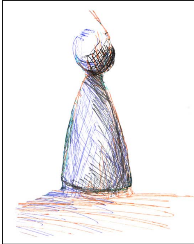
Figure 3. She is Sonia