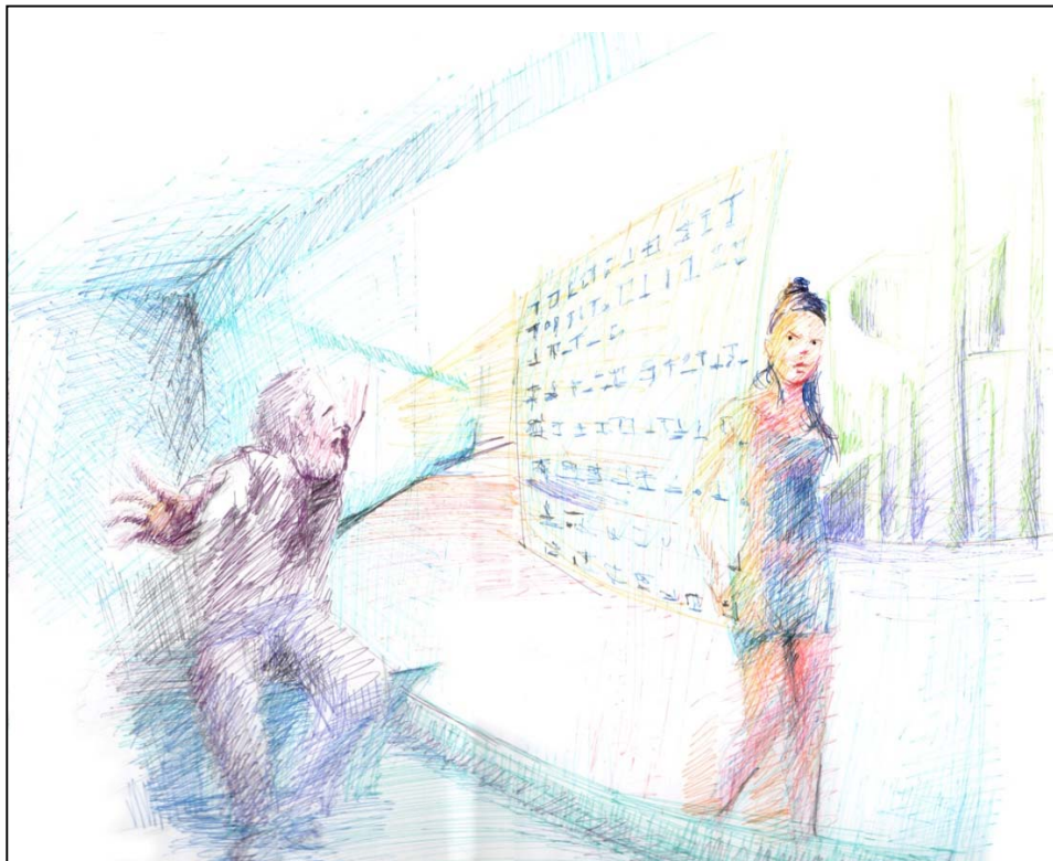
Figure 1. The MDI shows my digital profile

Then, in the blink of an eye, everyone had removed the pocket projector, the mirror and the camera from their necks to fit it into their ear ... puff!!! Surely in a short time the sixth sense will have to be used in a grafted way into the brain. So, I do not have any hurry in having now the Sixth Sense grafted in my ear, nooooo, I will not get it off from my neck and I do not know if I want to use the MDI all the time.