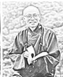
Master Sheng Yen